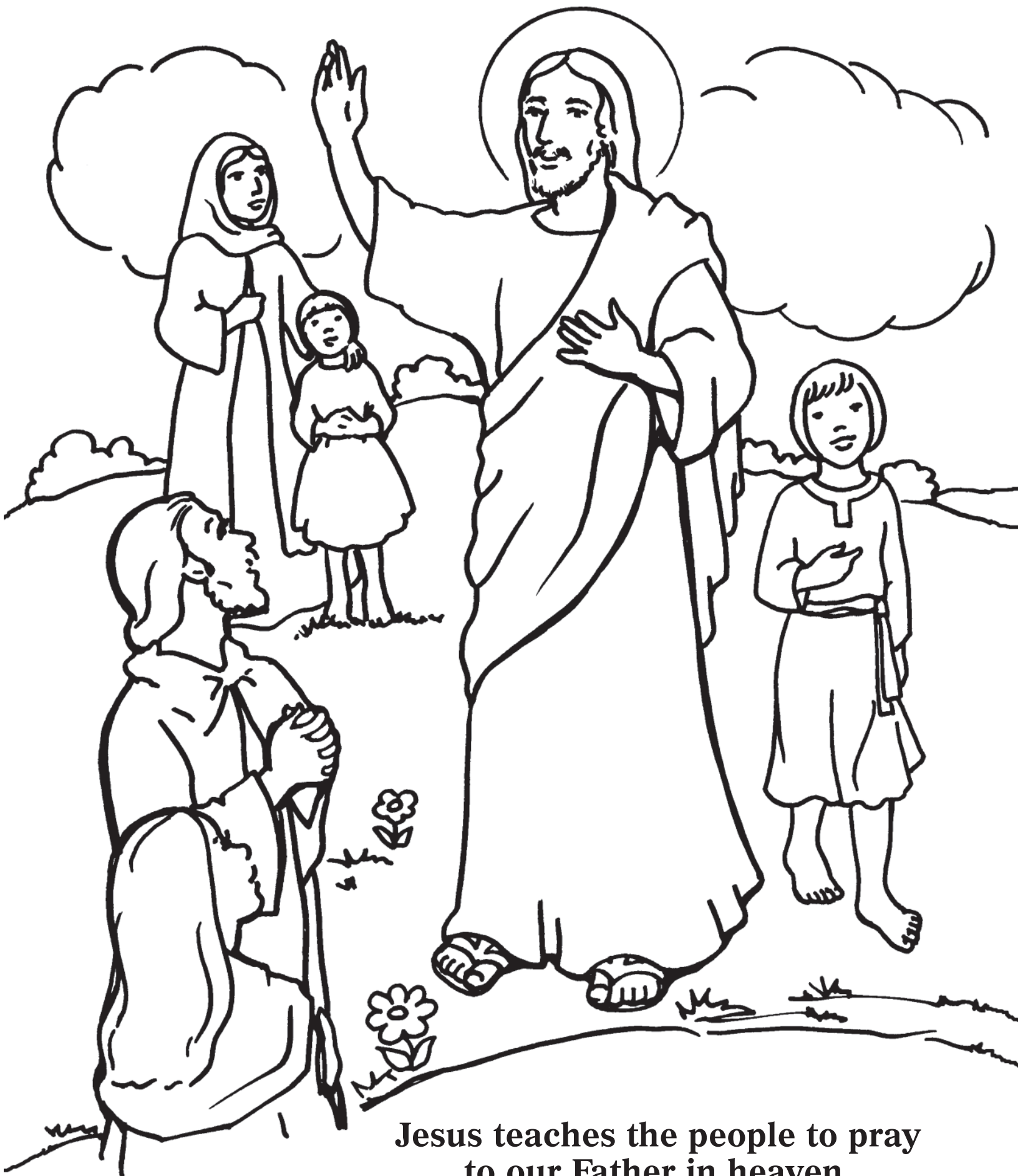
Jesus teaches the people to pray to our Father in heaven.